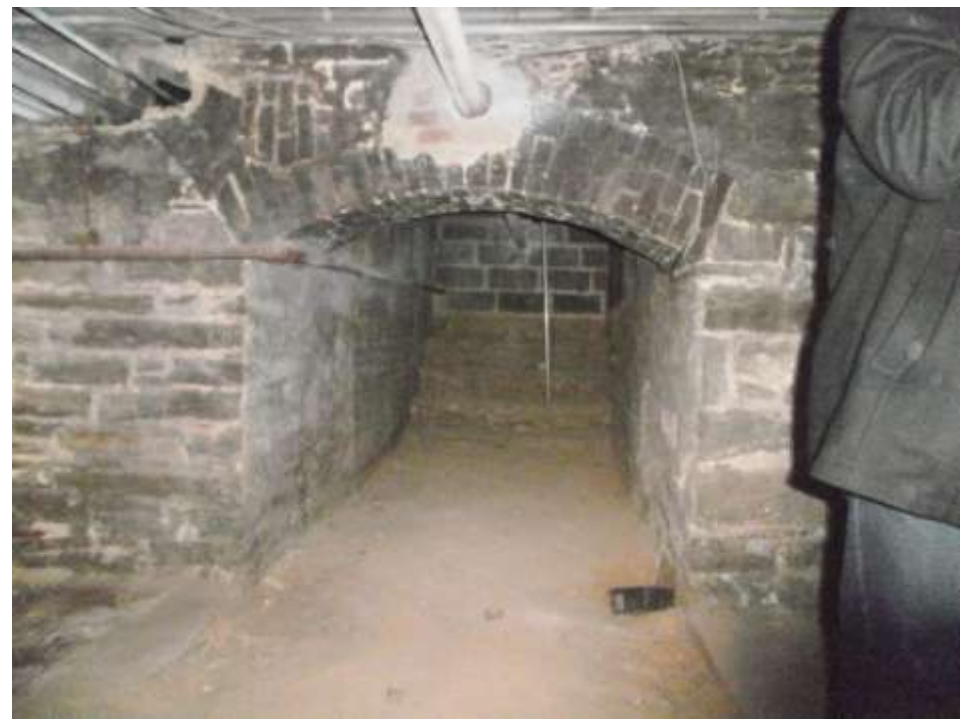
Plymouth Church basement. In densely populated Brooklyn Heights, fugitives would have had to sit in the dark at night so that no one would see lights where they hid.