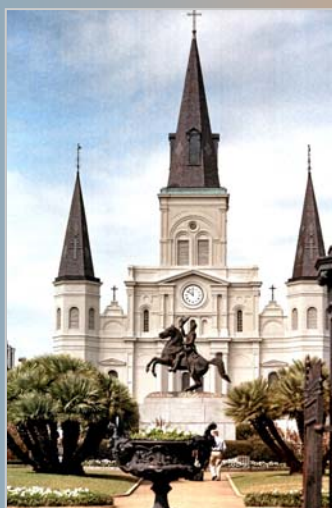
St. Louis Cathedral, French Quarter