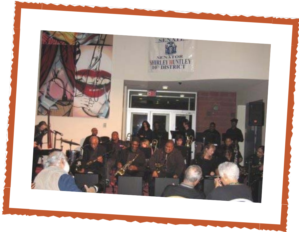
Jazz Forum #23 with saxophonist Sue Terry on March 17, 2008