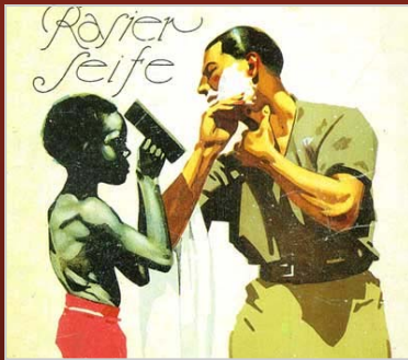
19th century colonialism in action