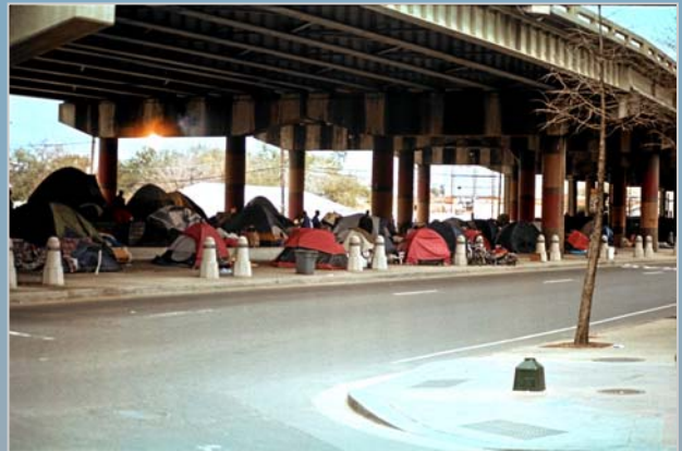
Homeless in New Orleans sheltering under an overpass