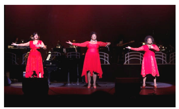
The Three Mo' Divas graced the 2011 Annual Fundraising event with their performance (r.).