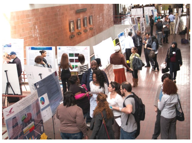
Students and faculty where intensely engaged in the discussion of various research projects conducted by students

According to Vigani, products such as Pro gresso Soup and Di-Giorno, a popular frozen pizza, are neither from Italy nor made by Italian -Americans.