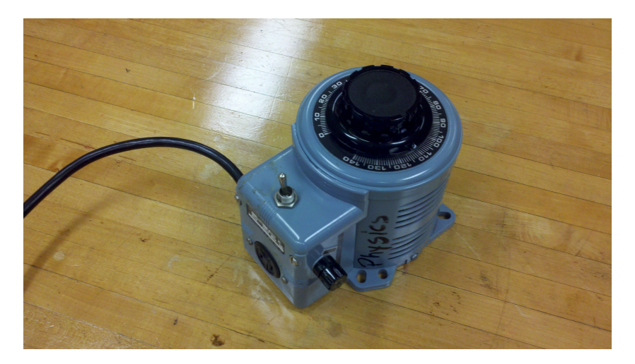
Figure 2: The variable transformer, aka variac.

is just a resistor, after all - dissipates power according to the relation