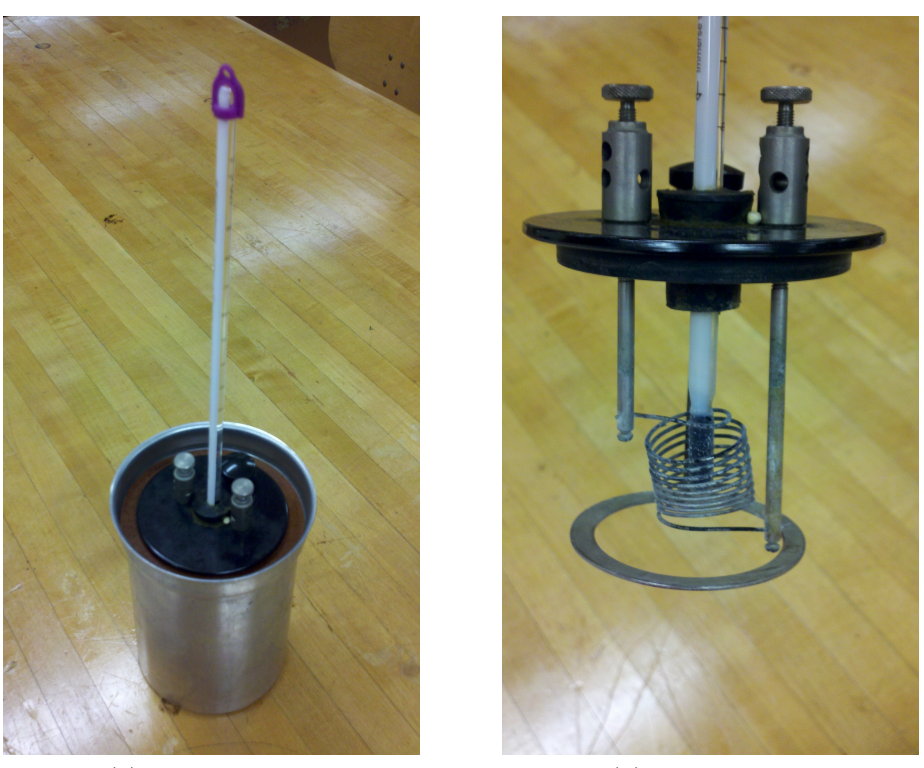
(a) External View