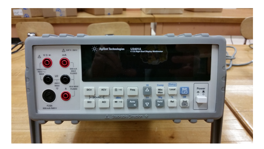
Figure 4: The high precision Agilent U3401A multimeter.

3. Build the circuit shown in Figure 3, which will be run at 120 V AC; we will talk about AC or alternating current at a future date. For this lab, the differences between AC and DC voltages are irrelevant; just follow the directions here. The multimeter measuring voltage should be set to the AC V setting; the multimeter measuring current should be set to the AC I setting, and should use the lower right, red 10 A and right hand, black LO inputs; see Figure 4.