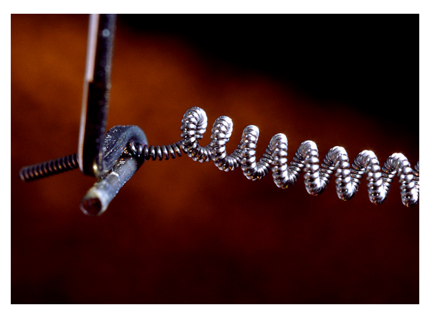
Figure 1: The coiled coil of an incandescent bulb filament.

This is a single relation between four variables; if you know any three of them, you can calculate the fourth. Dimensional analysis should convince you that the SI units of resistivity are \Omega \cdot m .